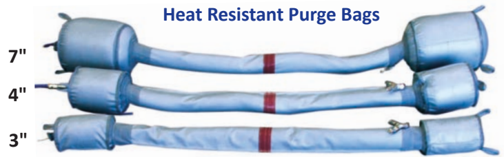
e.g. 7" Pipe will purge in less than 4 minutes!

The welder can position these systems prior to pre-heating and leave them in place throughout the pre-heating, welding and post-heat treatment cycles, allowing the weld to be purged continuously for up to 24 hours if necessary.